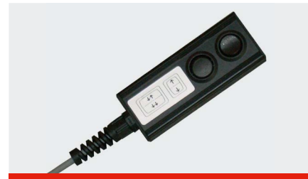
Remote control with cable