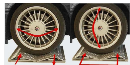
Functionality of plates