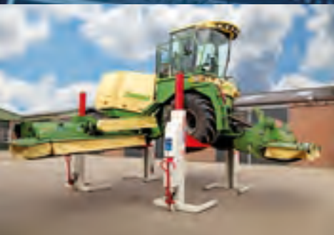
MOBILE COLUMN LIFT

STERIL SUPERIOR SOLUTIONS BY QUALITY PEOPLE